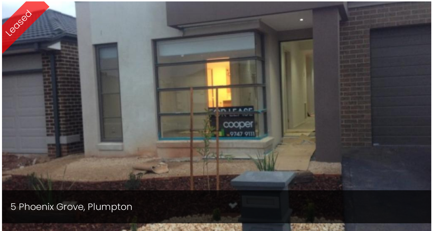
5 Phoenix Grove, Plumpton