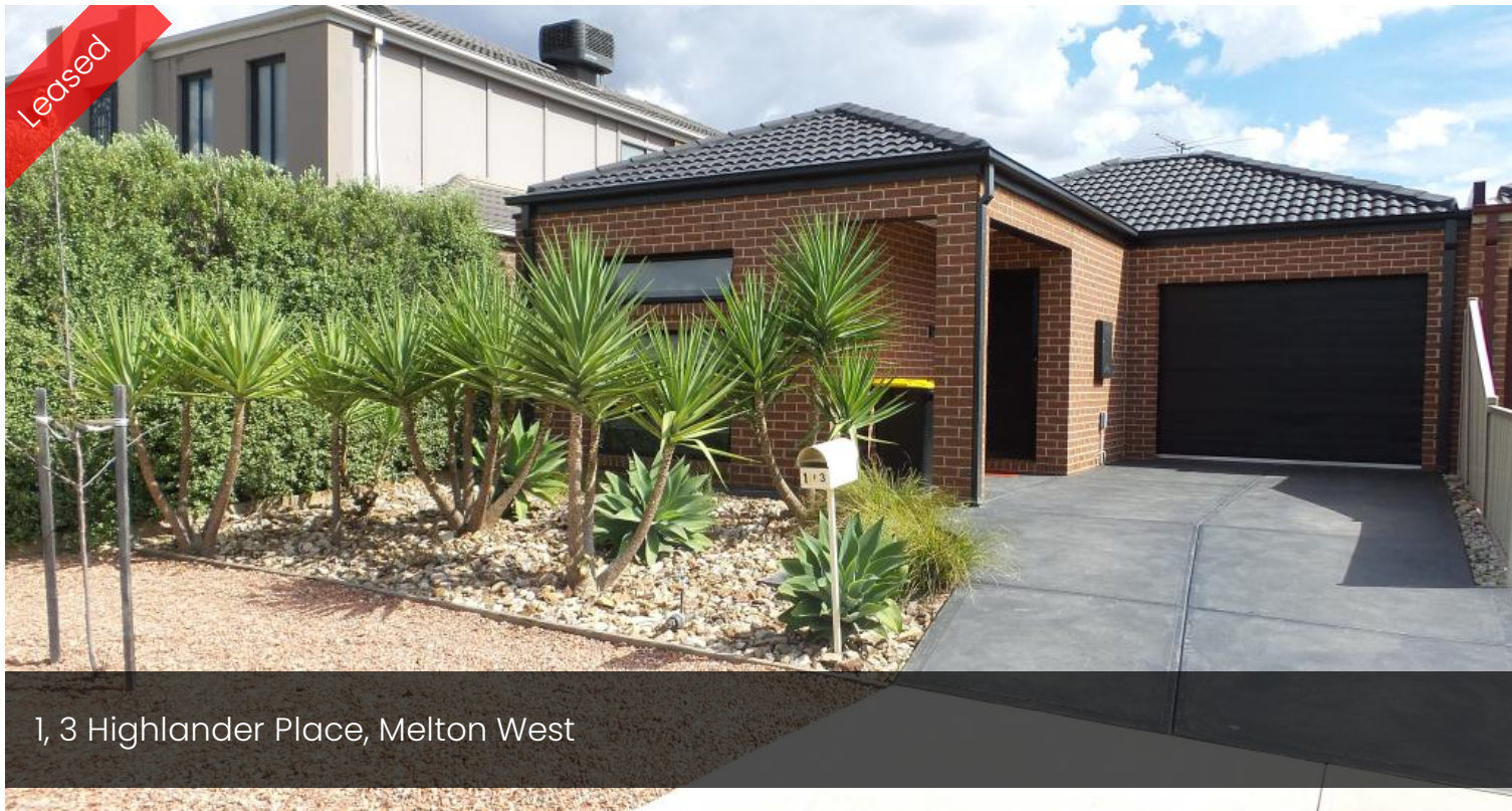
1, 3 Highlander Place, Melton West