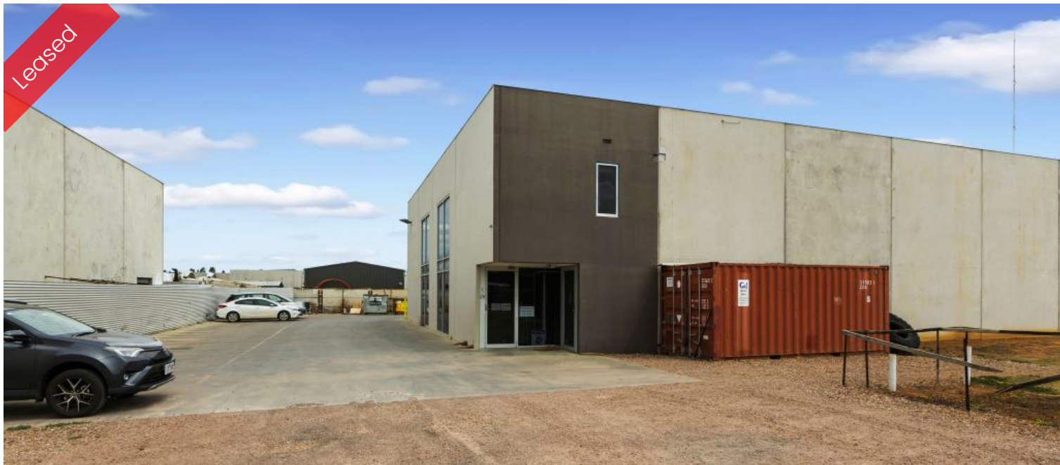
Factory 1, 29 Reserve Rd, Melton