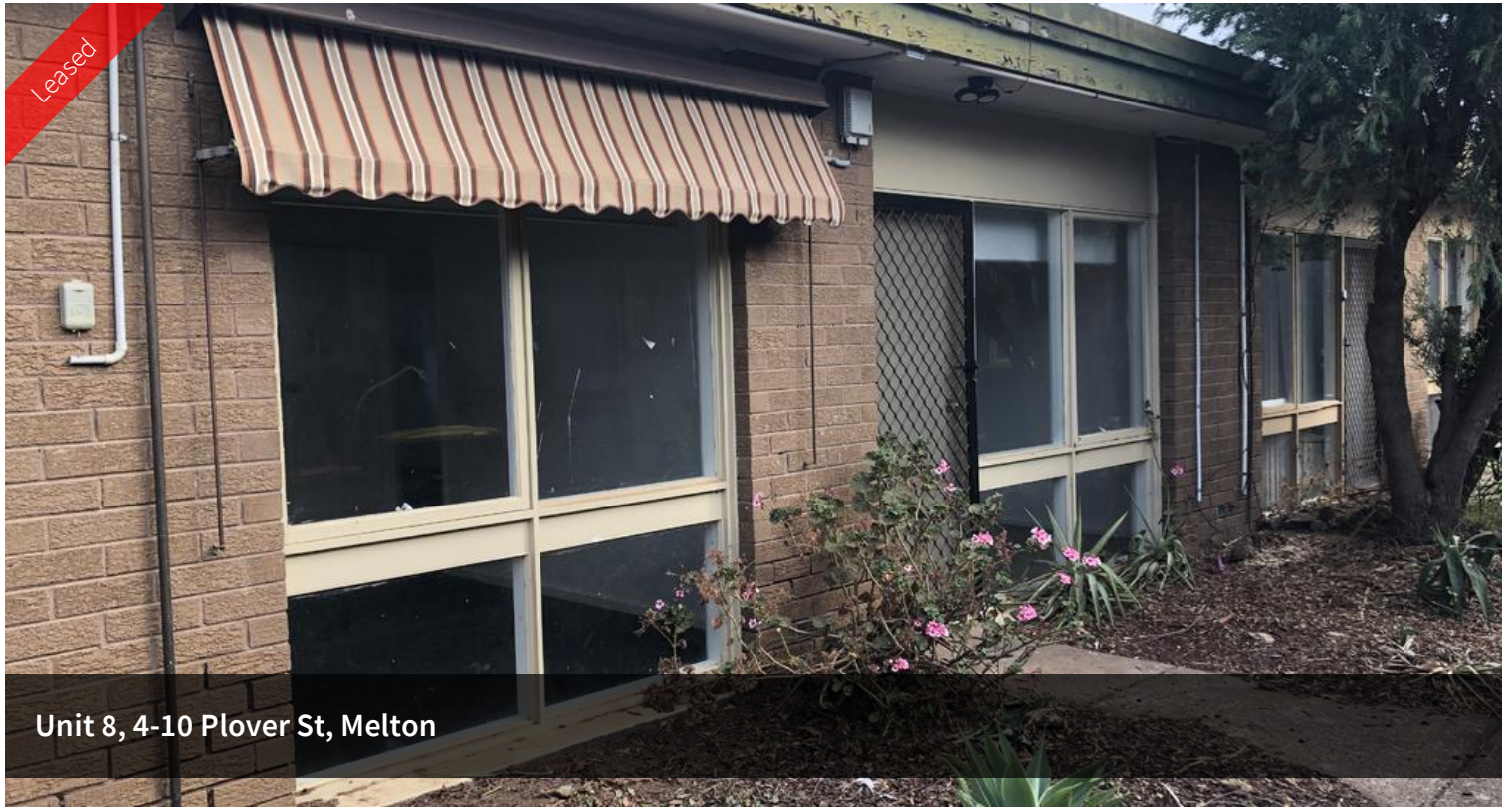
Unit 8, 4-10 Plover St, Melton