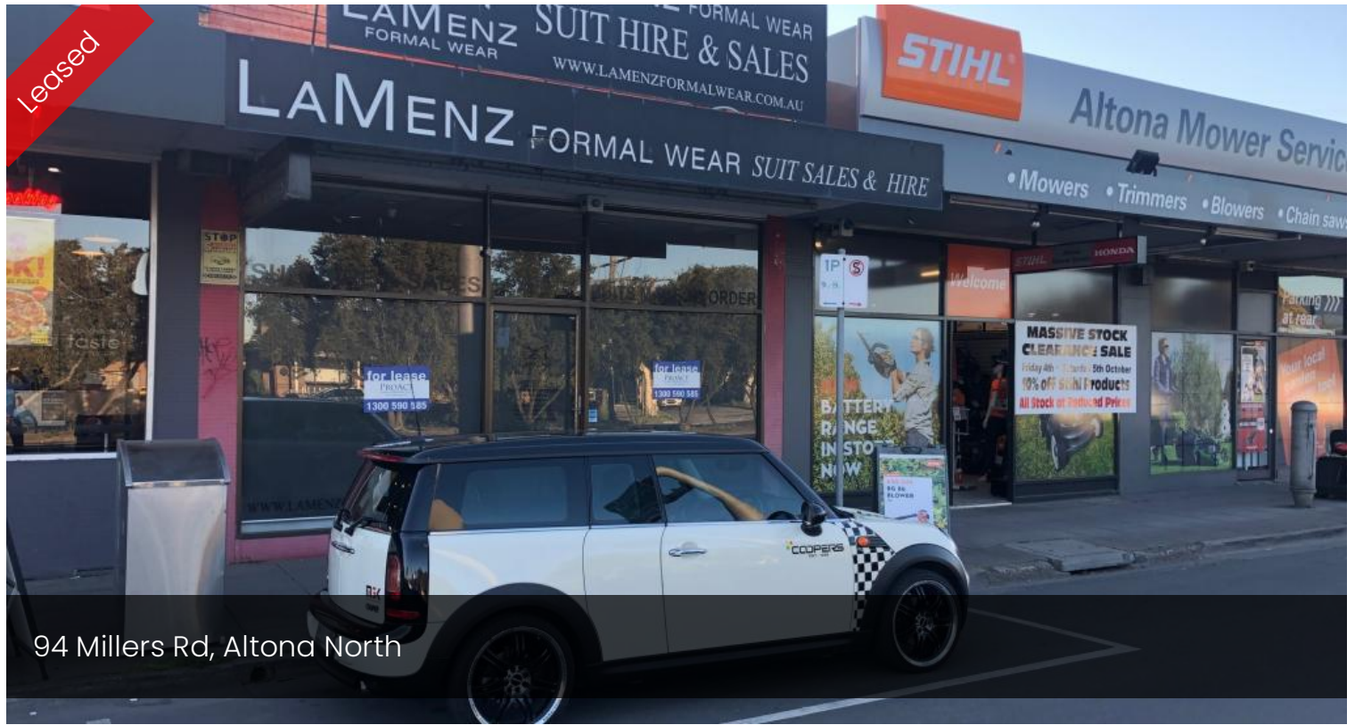
94 Millers Rd, Altona North