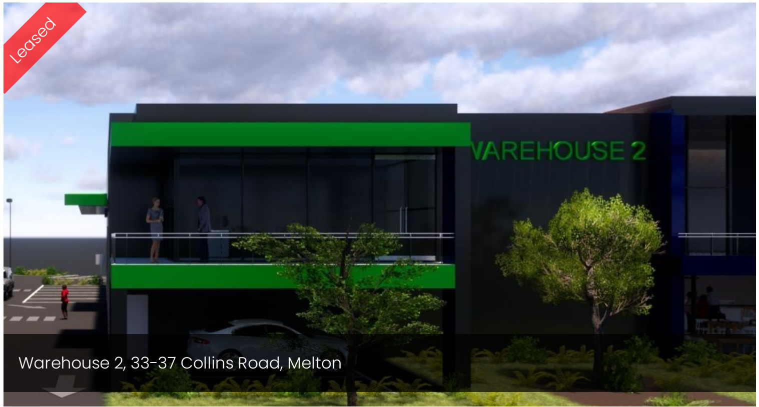
Warehouse 2, 33-37 Collins Road, Melton