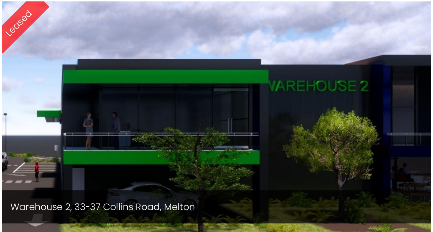
Warehouse 2, 33-37 Collins Road, Melton