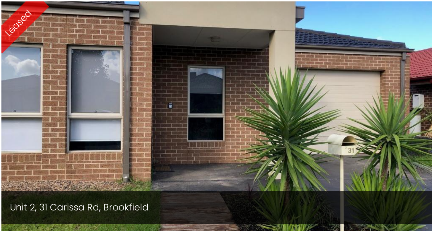
Unit 2, 31 Carissa Rd, Brookfield

03 9747 9111 to arrange a private inspection. Please Note: Full Contact Details Must Be Provided Mask Must Be Worn. 1 Person Plus Any Dependant & Your Partner Can Accompany You On The Inspection