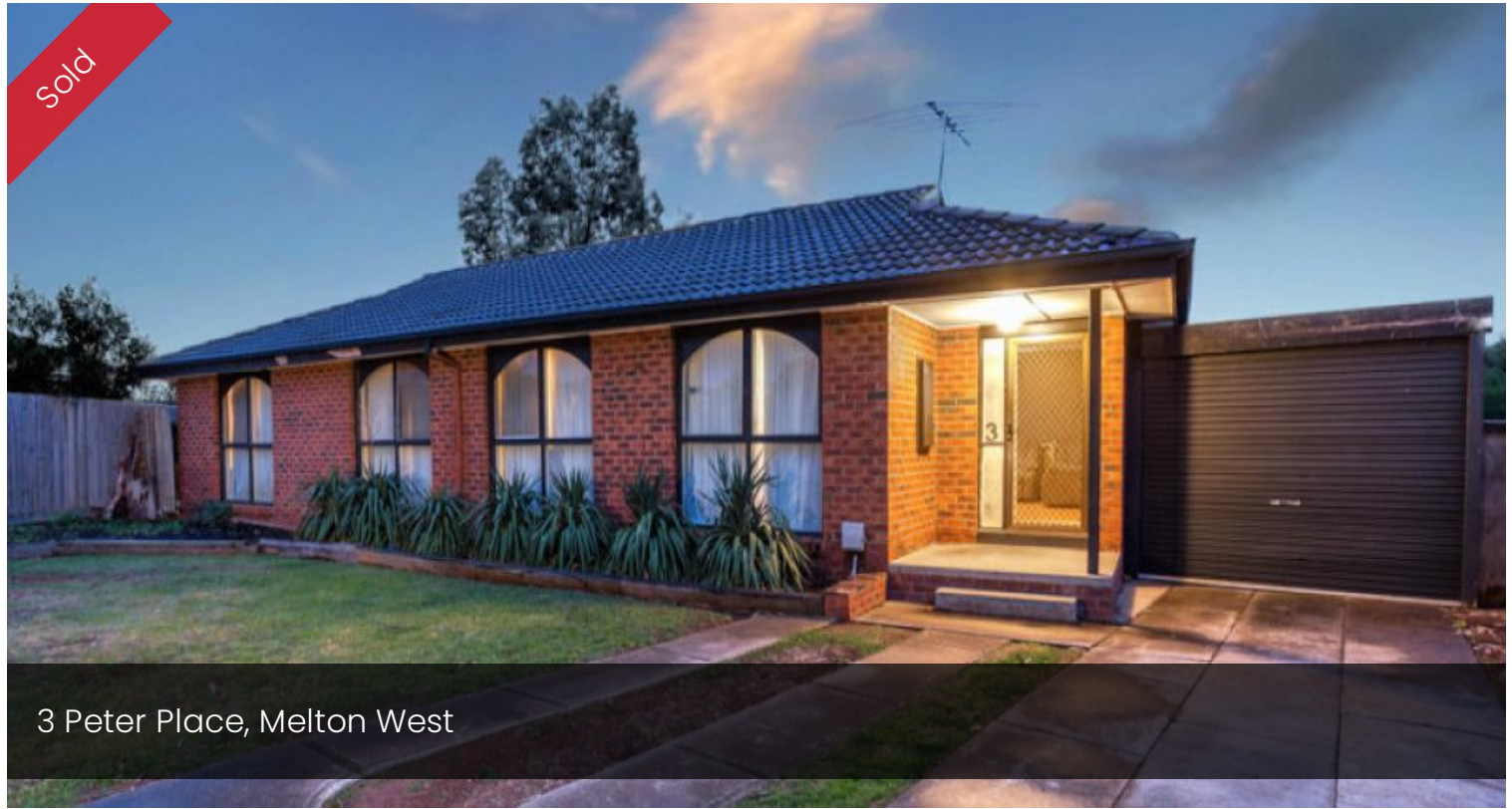
3 Peter Place, Melton West