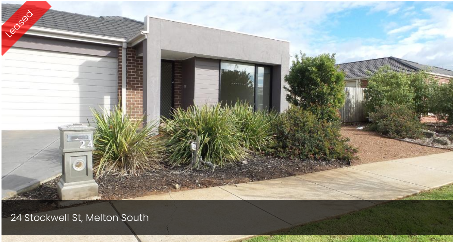
24 Stockwell St, Melton South