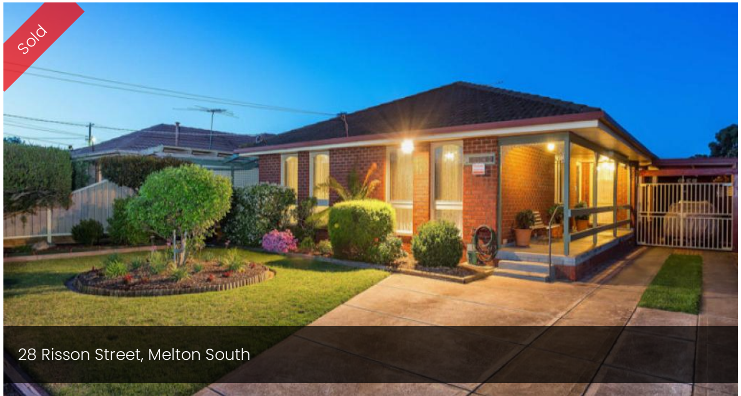
28 Risson Street, Melton South