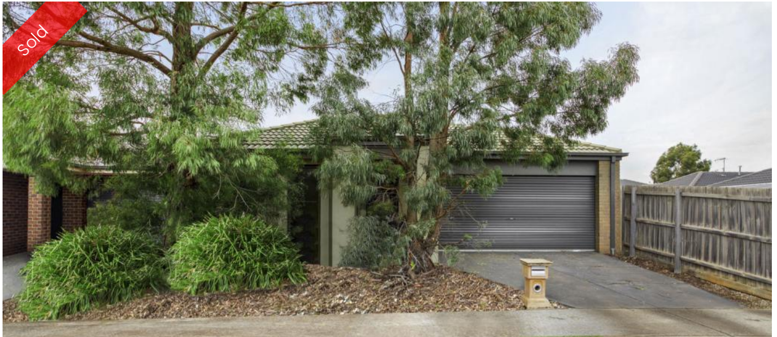
Sold 4 Hall Mark Place, Kurunjang