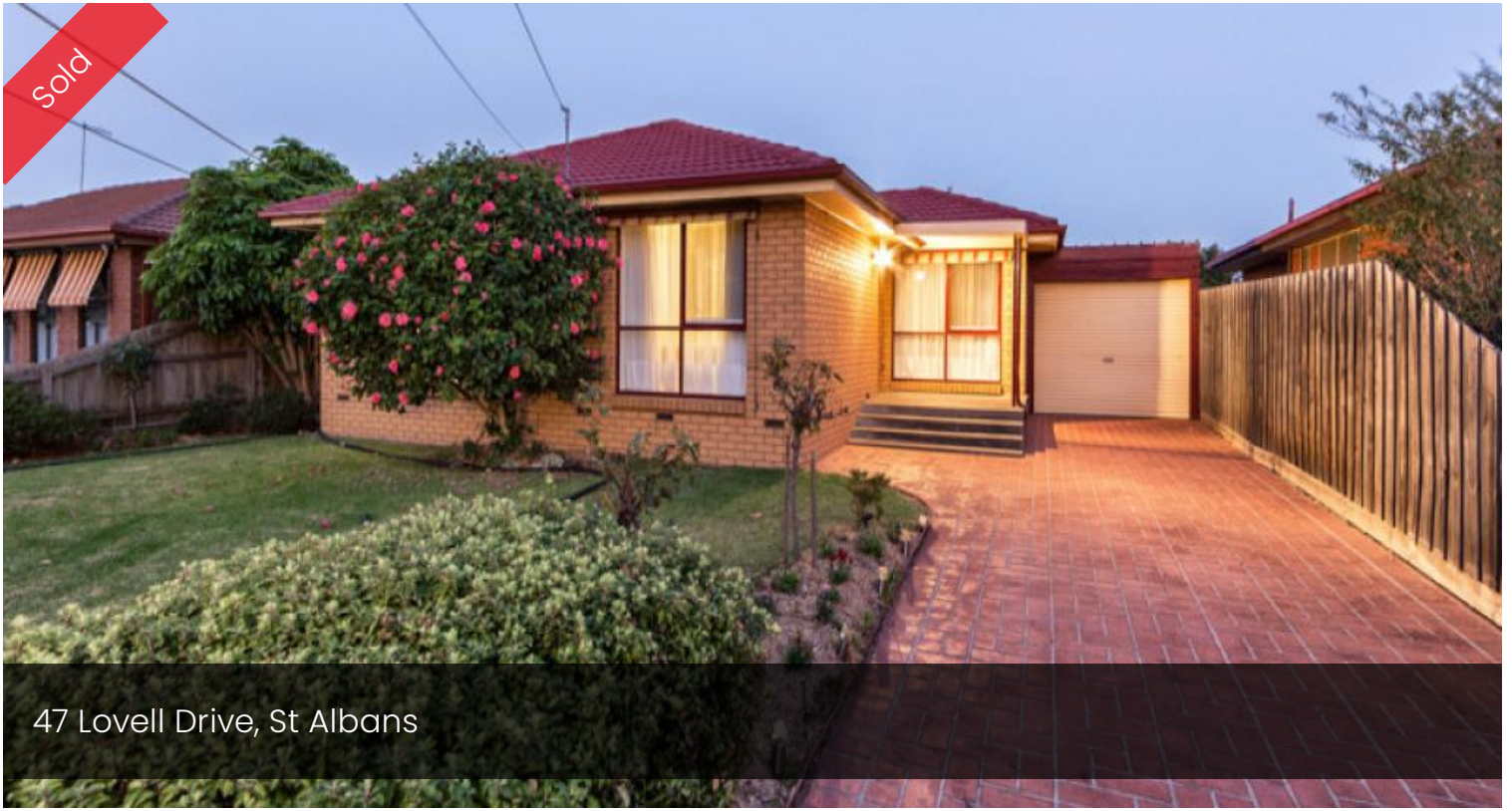
47 Lovell Drive, St Albans