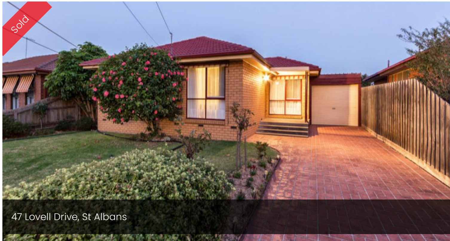
47 Lovell Drive, St Albans