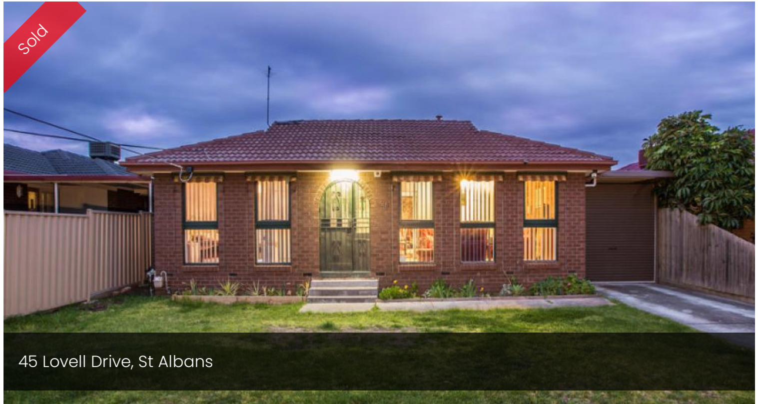
45 Lovell Drive, St Albans