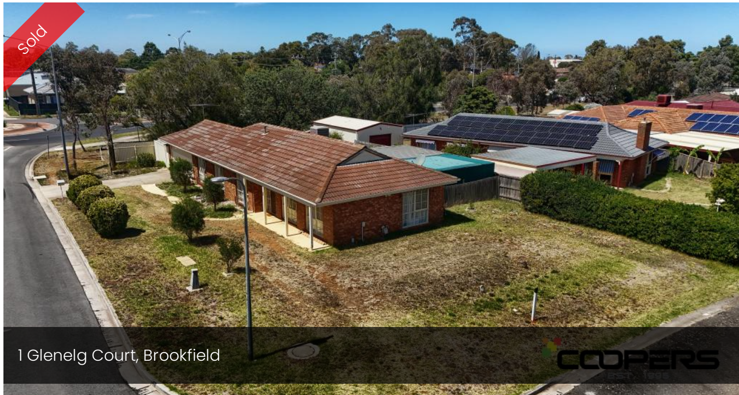
1 Glenelg Court, Brookfield