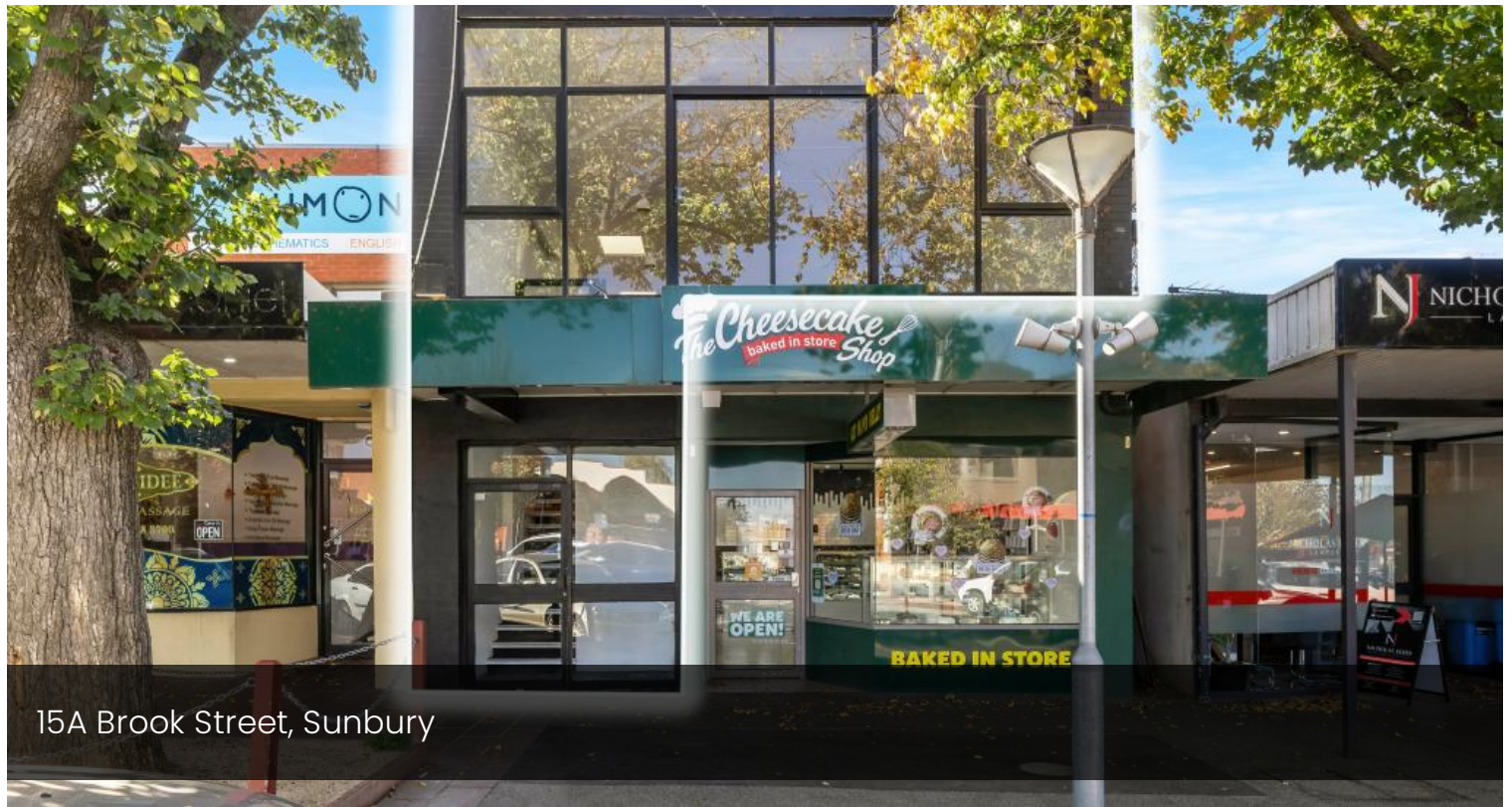
15A Brook Street, Sunbury