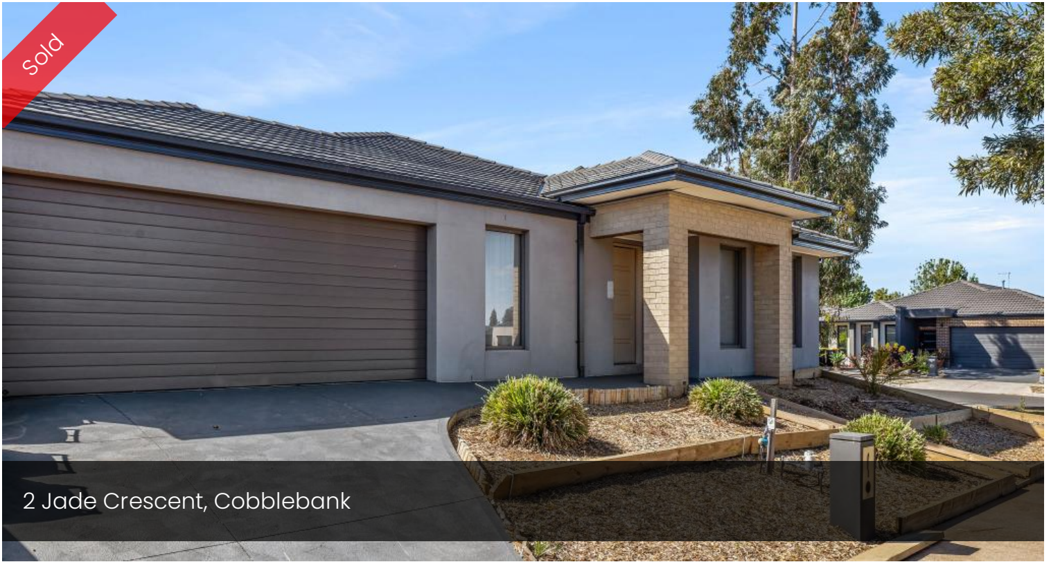
2 Jade Crescent, Cobblebank