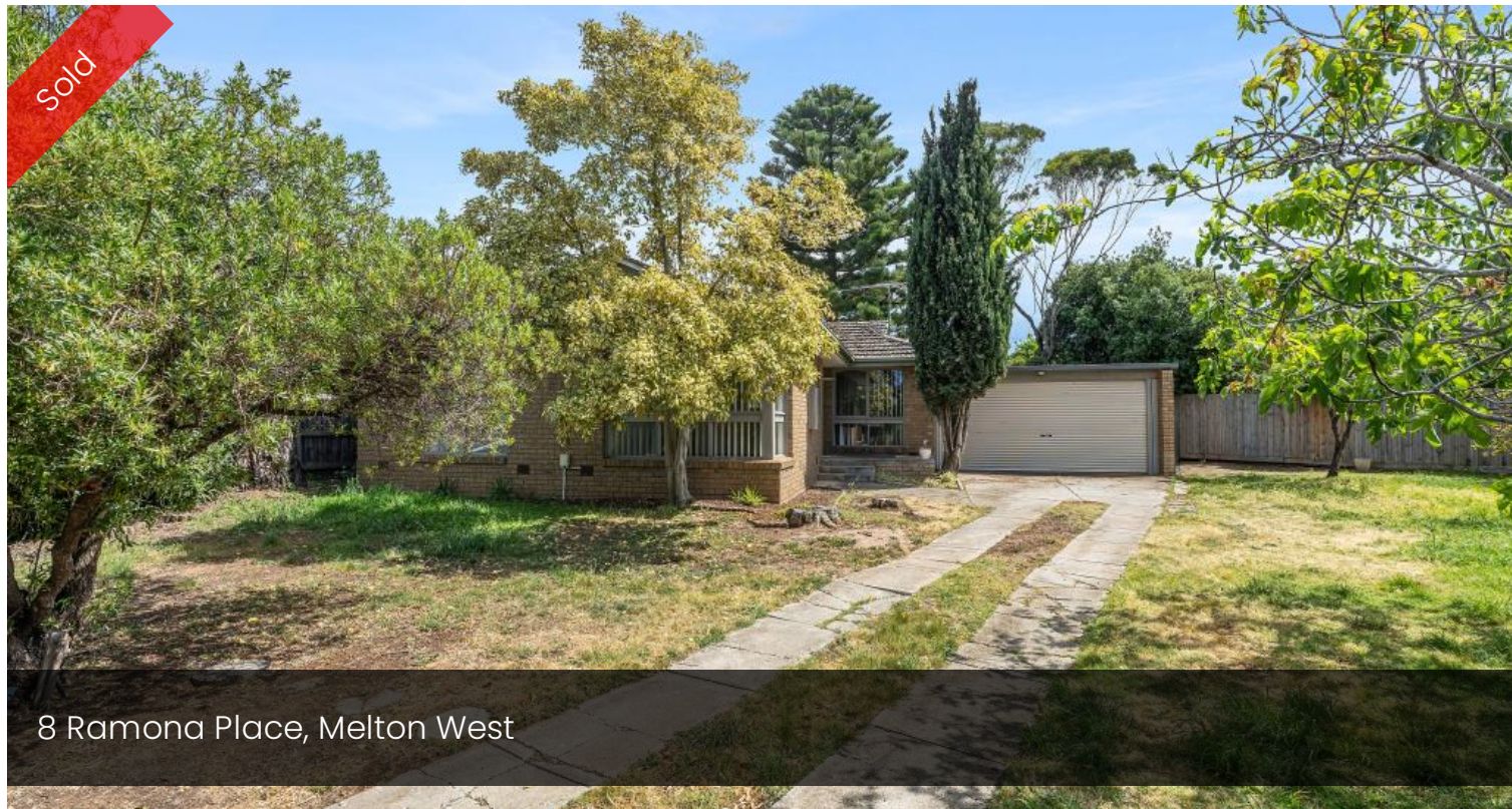
8 Ramona Place, Melton West