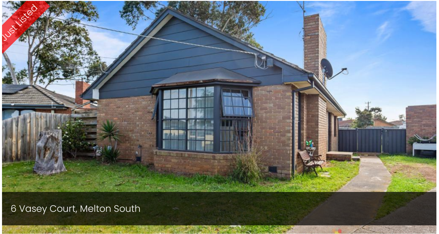
6 Vasey Court, Melton South