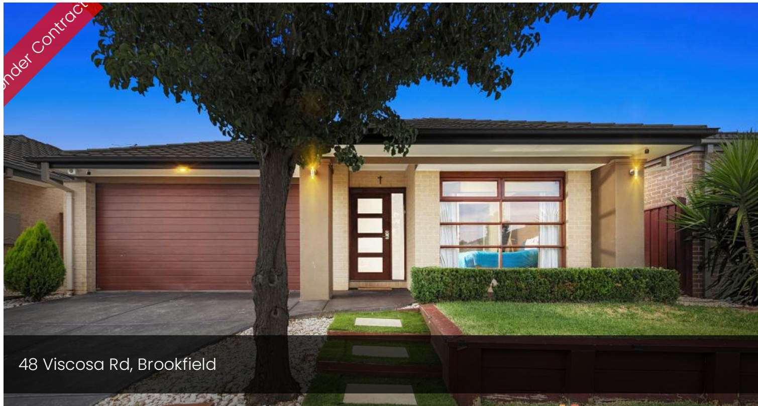
48 Viscosa Rd, Brookfield