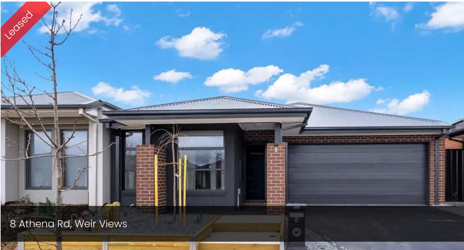
8 Athena Rd, Weir Views