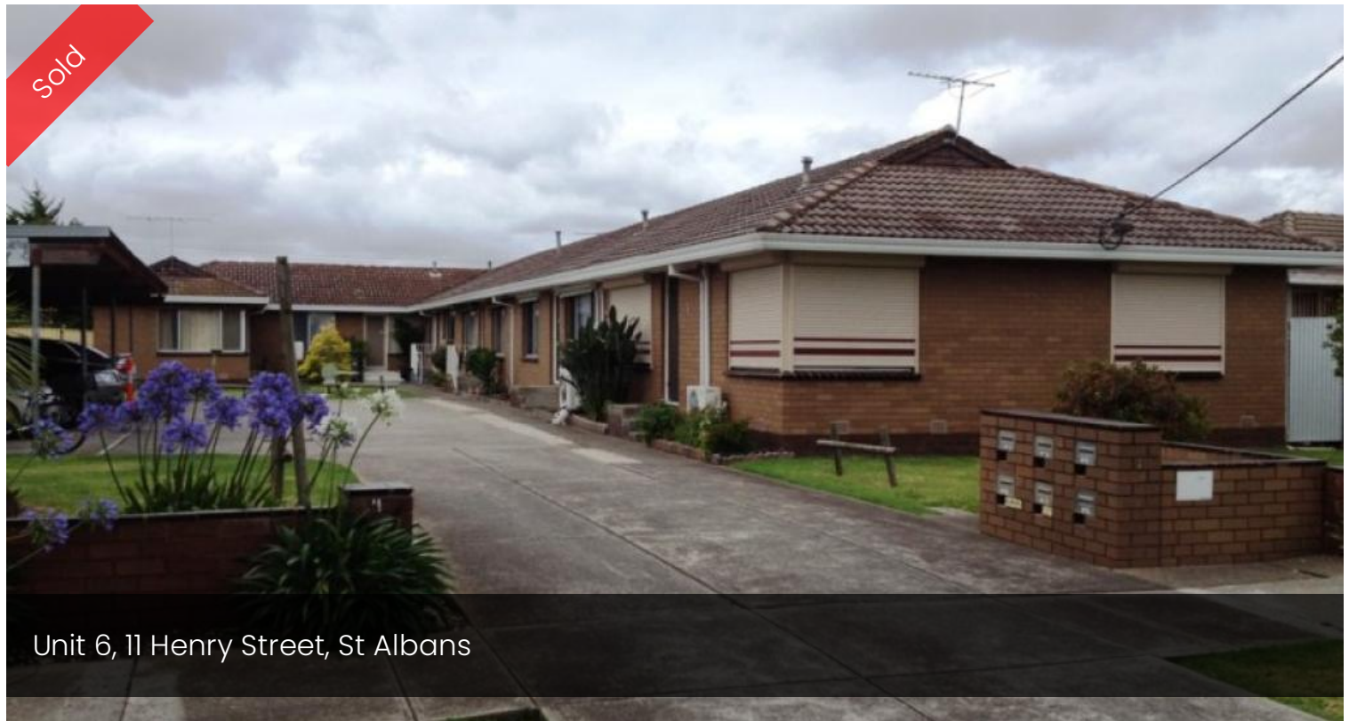
Unit 6, 11 Henry Street, St Albans