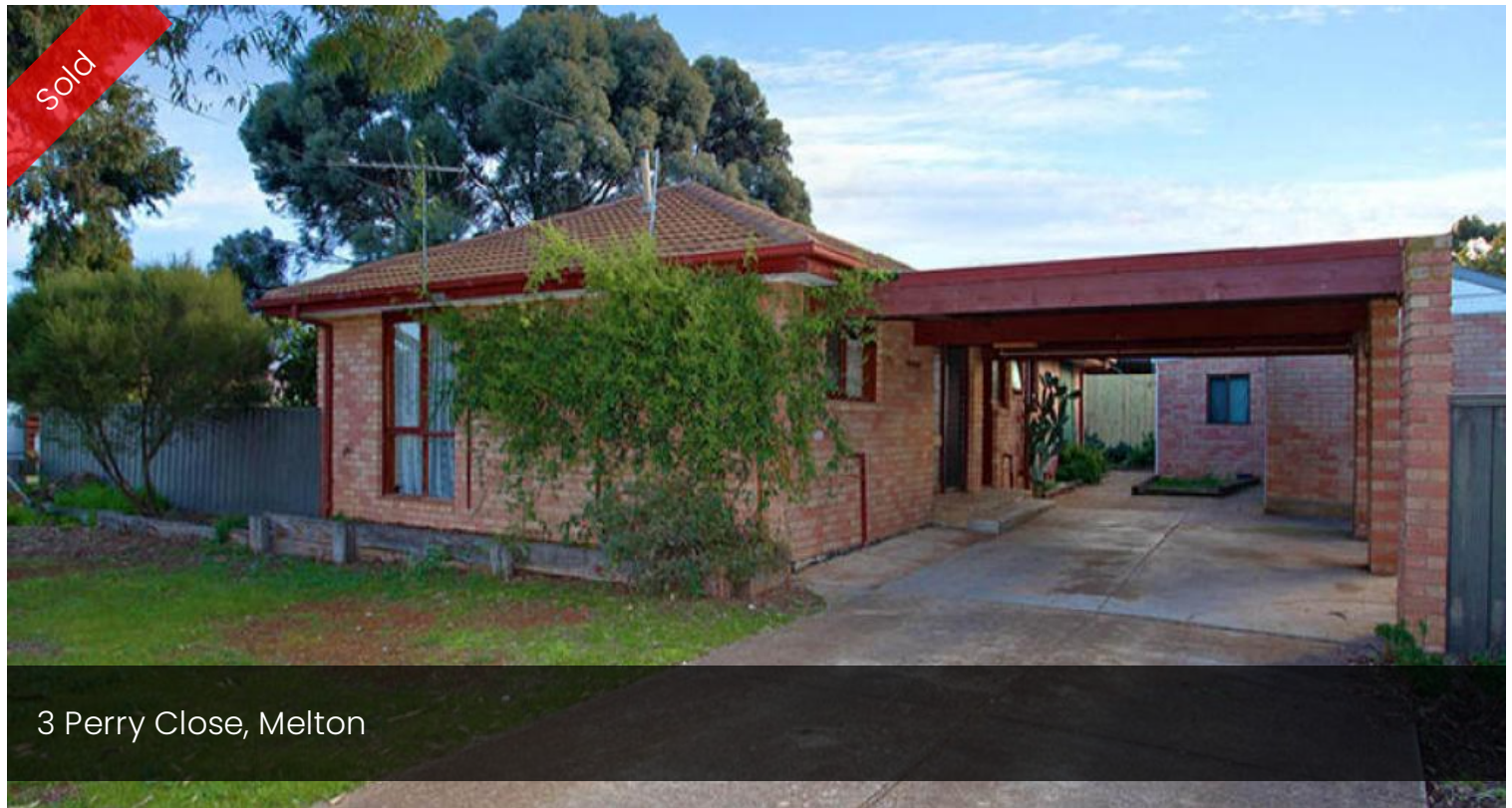
3 Perry Close, Melton