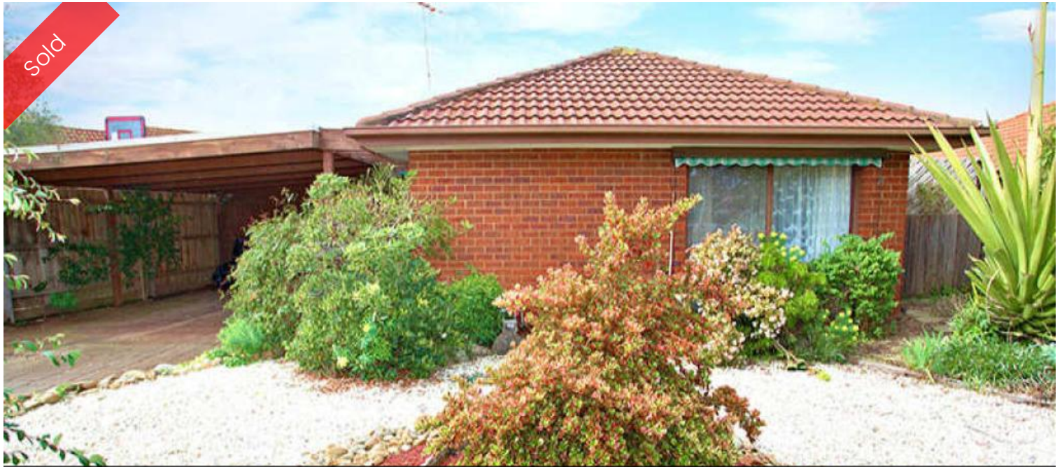
3 Pennyroyal Crescent, Kurunjang