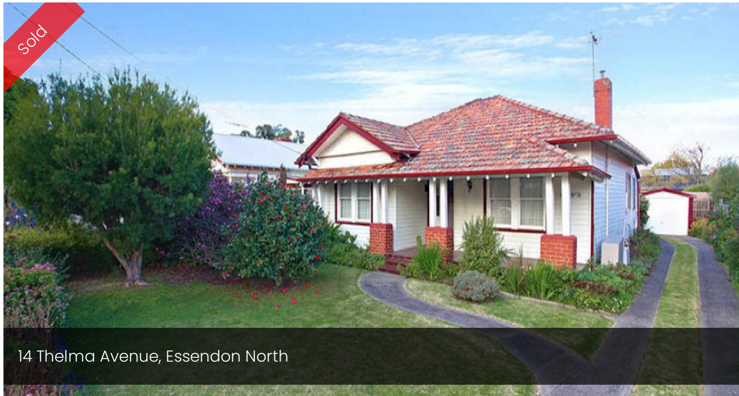
14 Thelma Avenue, Essendon North