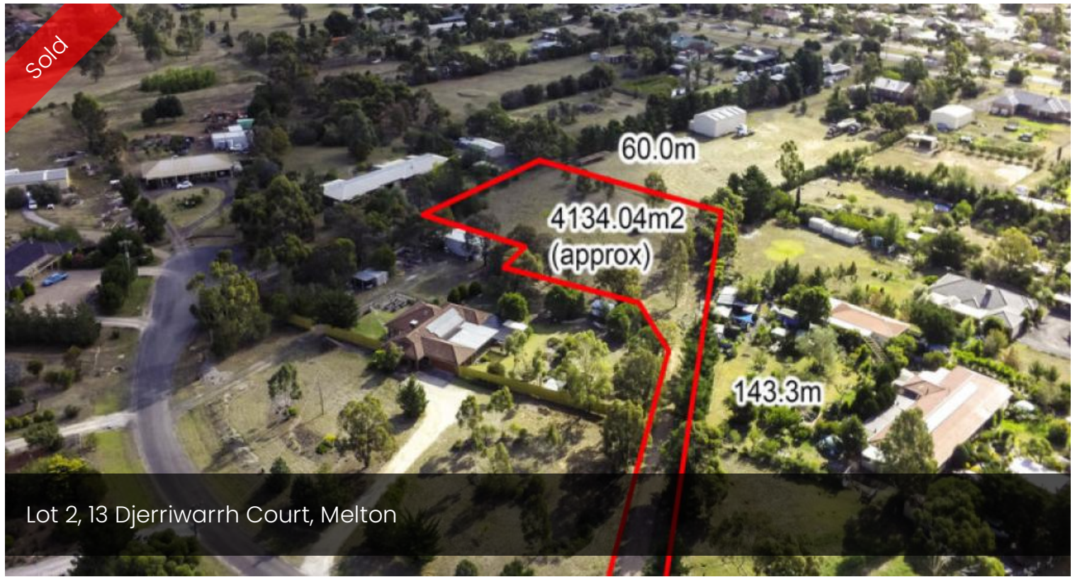
Lot 2, 13 Djerriwarrh Court, Melton