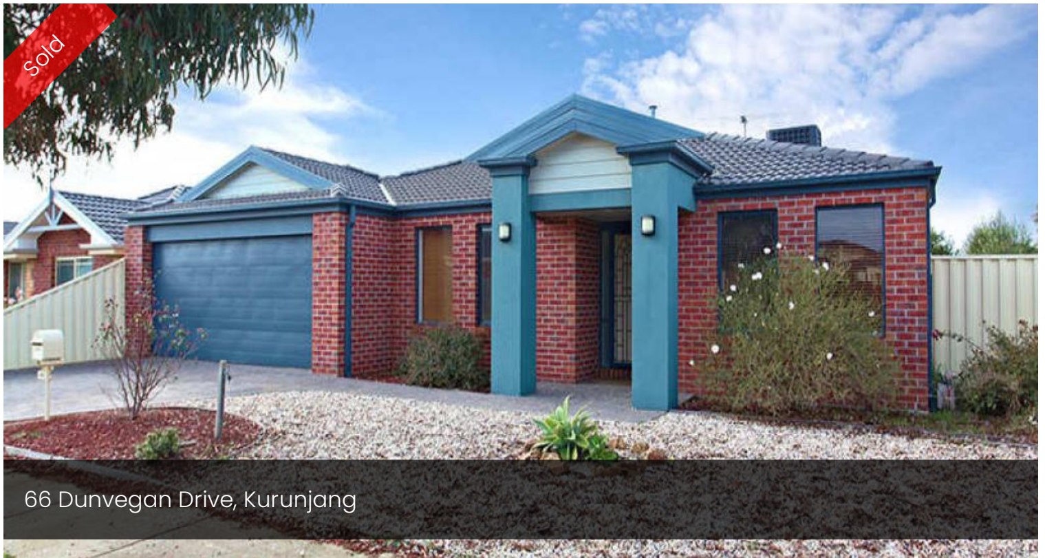
66 Dunvegan Drive, Kurunjang