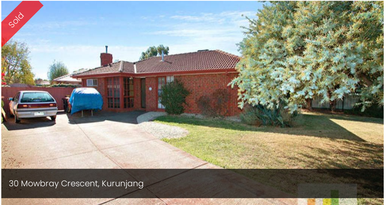
30 Mowbray Crescent, Kurunjang