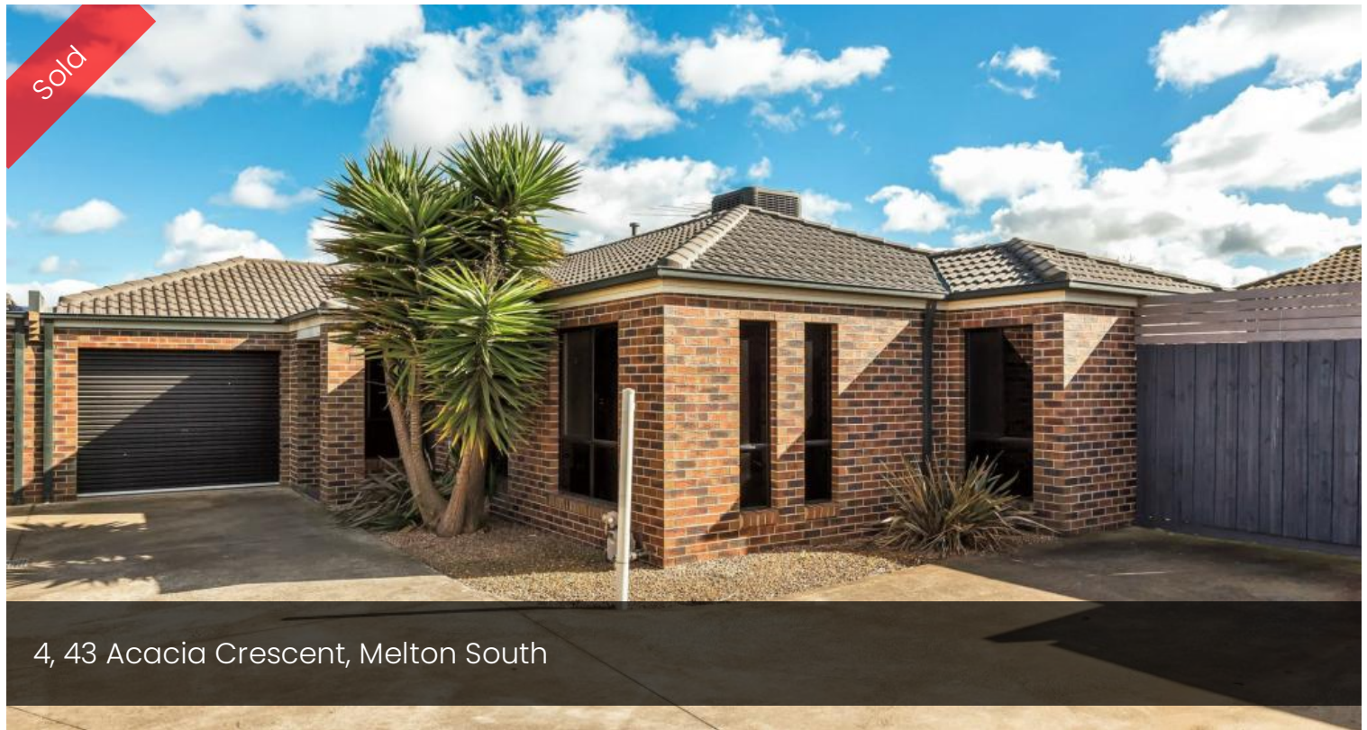
4, 43 Acacia Crescent, Melton South