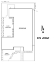
58 STRETTON DRIVE BROOKFIELD