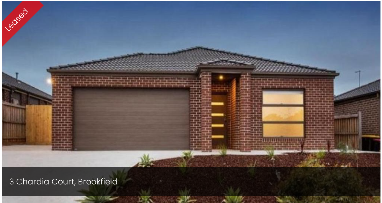
3 Chardia Court, Brookfield