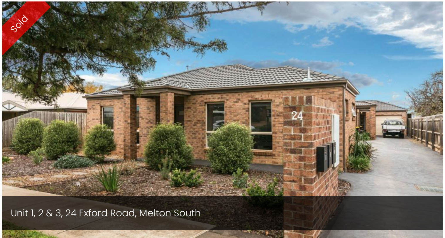
Unit 1, 2 & 3, 24 Exford Road, Melton South