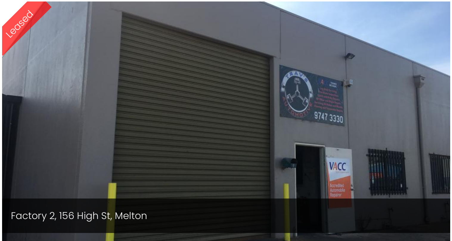
Factory 2, 156 High St, Melton