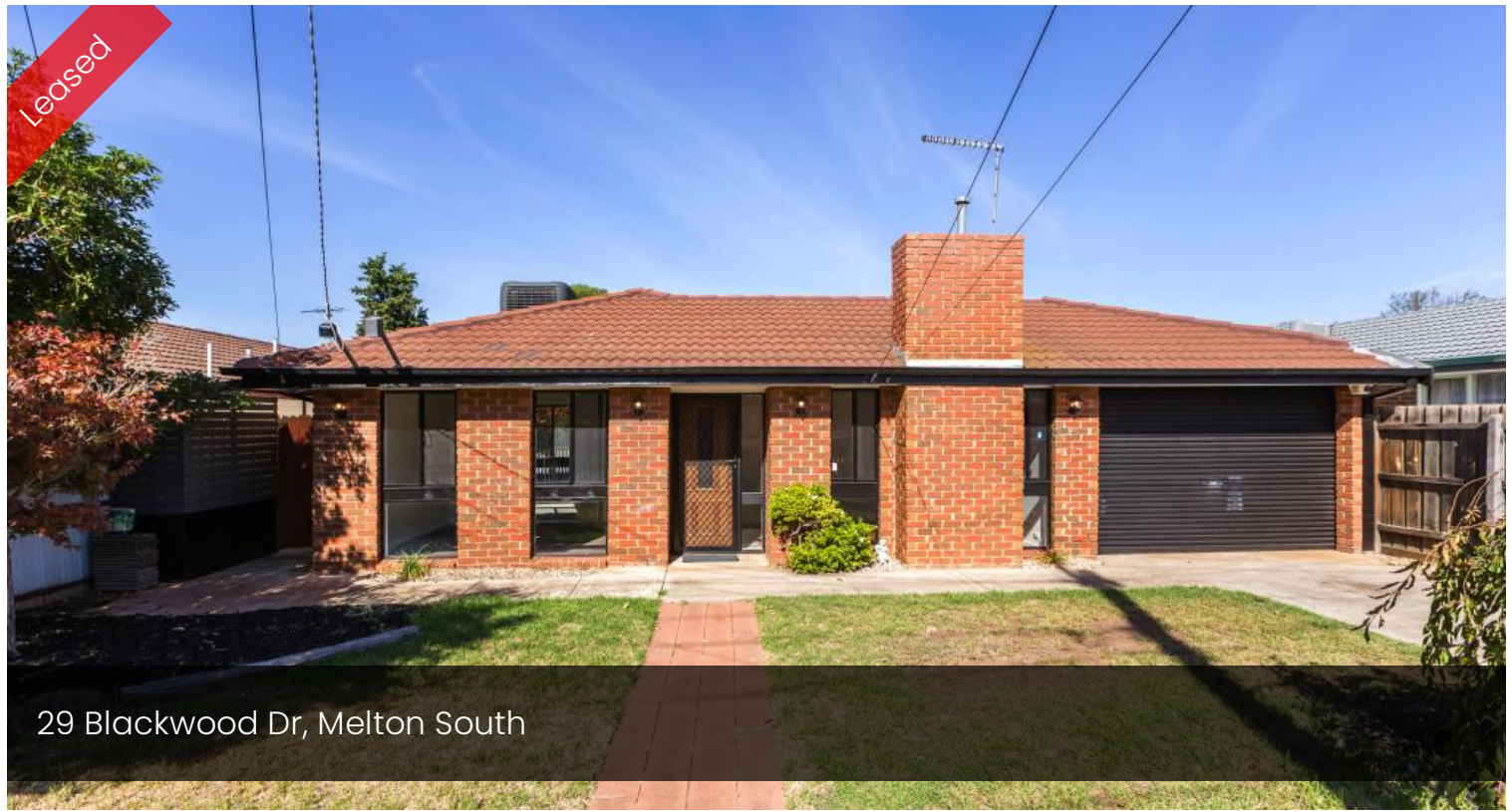
29 Blackwood Dr, Melton South