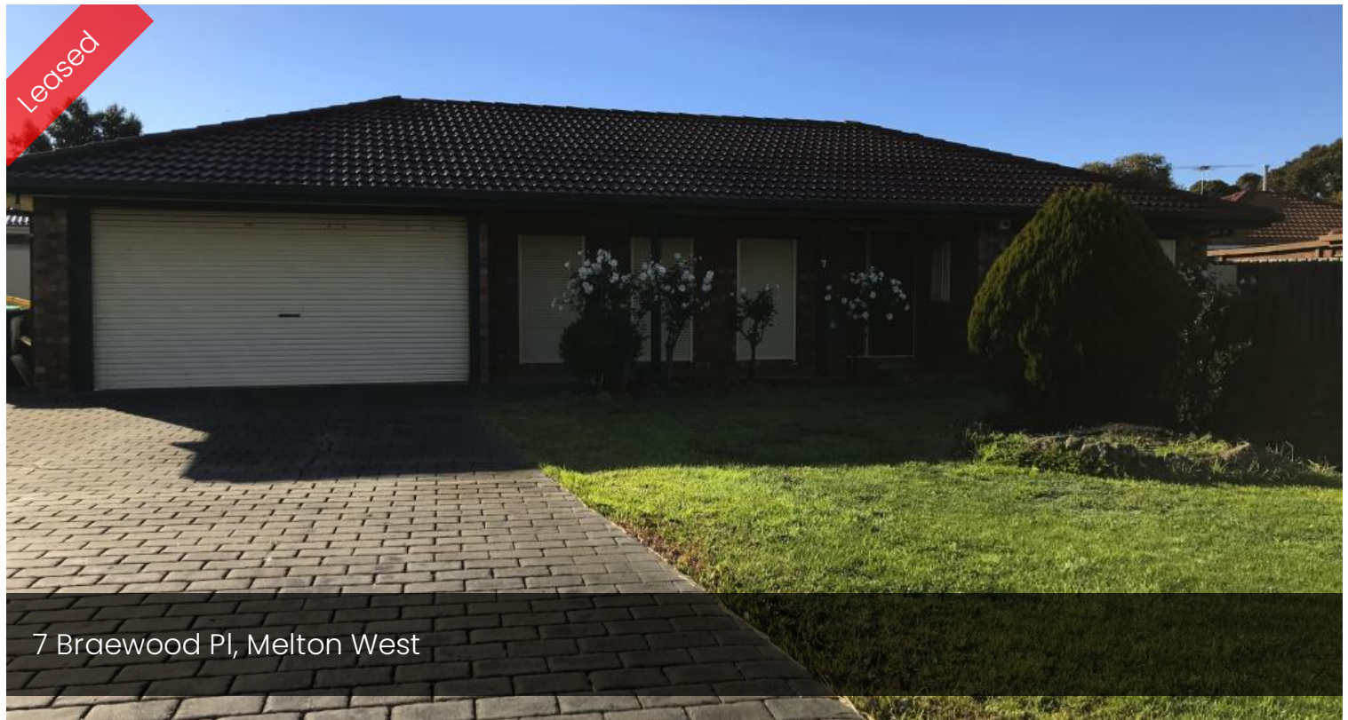
7 Braewood Pl, Melton West