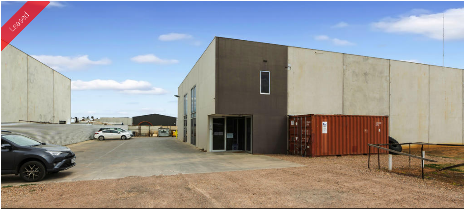
Factory 1, 29 Reserve Rd, Melton